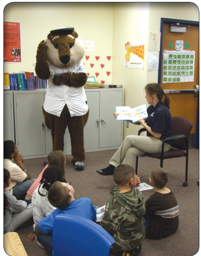
The community relations department makes appearances with Crash throughout the year.

And tomorrow, they will do it all over again. ●