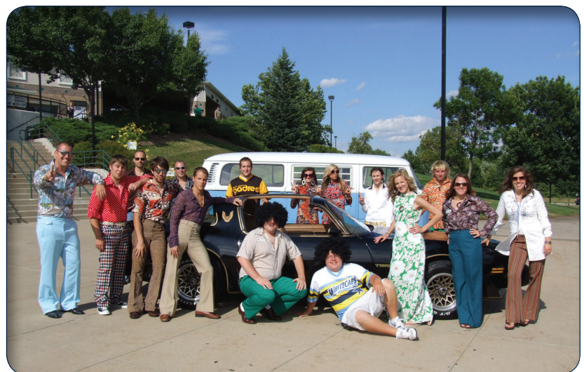
Promotions, like 70s Night, are planned in the fall for the upcoming season. Participation from the staff makes these theme nights fan favorites.