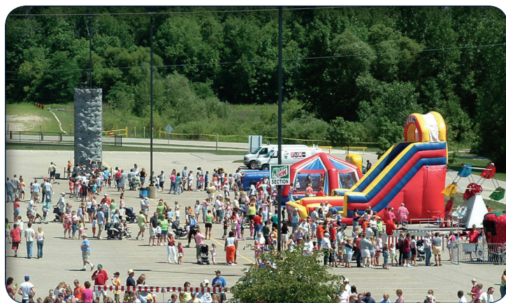
The Whitecaps staff plans and executes events all year round like the corporate outing on a non-gameday pictured above.

The West Michigan Whitecaps employ 33 full-time staff members that work at Fifth Third Ballpark year-round. These are the people responsible for coordinating marketing sponsorships, rolling out fan-friendly ticket offers, scheduling popular promotional acts, and keeping the organization active in improving the community -