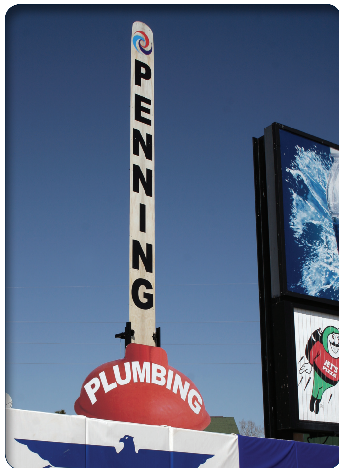
The Penning Plumbing, Heating and Cooling Plunger has become a fixture at Fifth Third Ballpark.